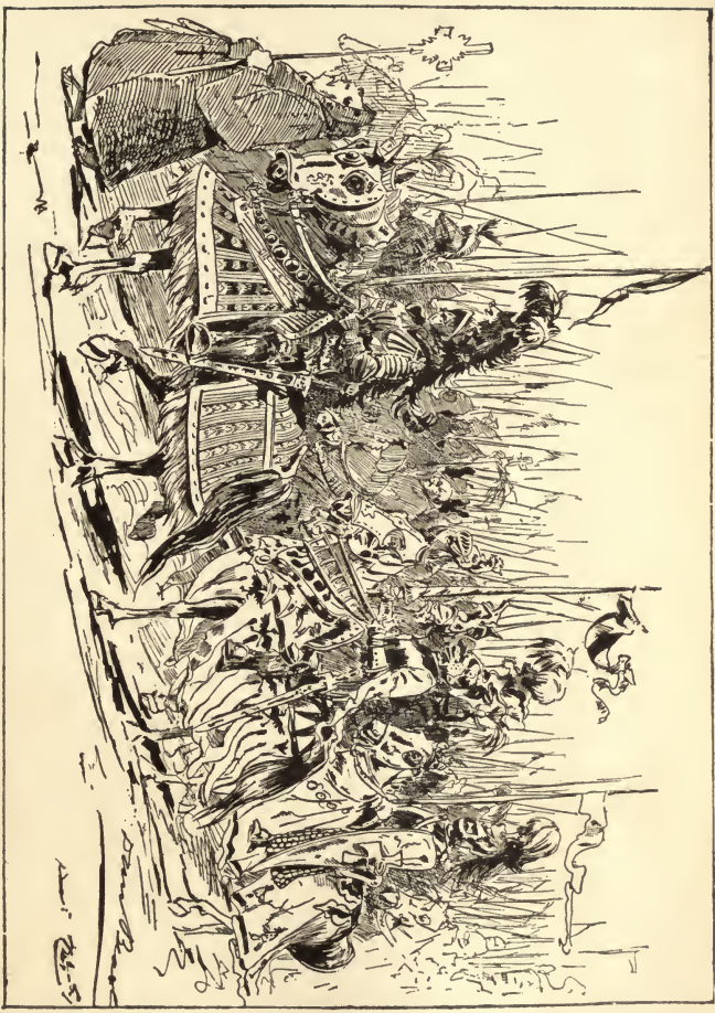
“THE SUN STRUCK THE SEA OF ARMOR AND SET IT ALL AFLASH”